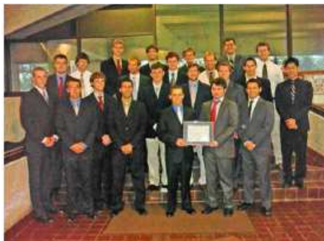
Previous Honors: Brothers at Troy City Hall receiving recognition from local government officials for volunteer work during the Troy Clean Up Day.