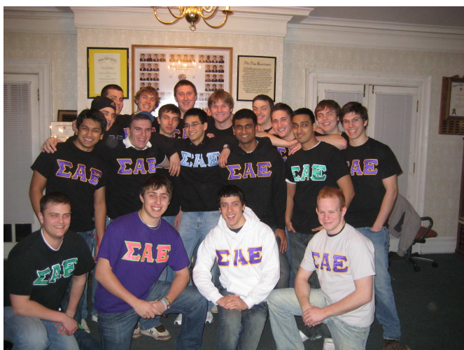
The large Fall 2008 Pledge class in the Chapter Room

We'll be calling the week of March 22 this year. Last year we had quite a successful year as we reached more alumni and had our second highest donation on record. From 185 alumni, we raised $24,100. Obviously, much of this happened before the huge crash in the economy, but we hope to come close to this amount again this year. Reaching more alumni is a key to that, so we continue to seek out updated addresses and phone numbers. Due to several emergent repair items (bathrooms, ceilings, floors, pipes), we burned through our maintenance budget of $20,000 and more in the fall term. So we continue to need your support as we head to our next big milestone of 50 years at scenic 12 Myrtle Avenue. To challenge your classmates this year, check out the 2008 donors list on the website: http://www.nyepsilon.com/alumni.html#phoneathon . Here's a quick summary of the top ten classes for participation rate and for dollar amount