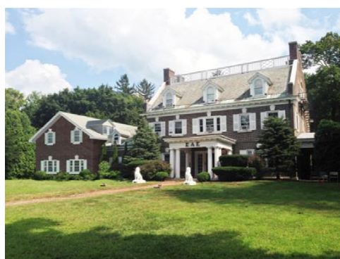
Architect rendering of one PTF concept