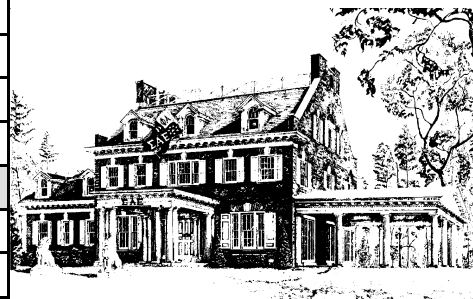
SIGMA ALPHA EPSILON NEW YORK EPSILON RENSSELAER POLYTECHNIC INSTITUTE