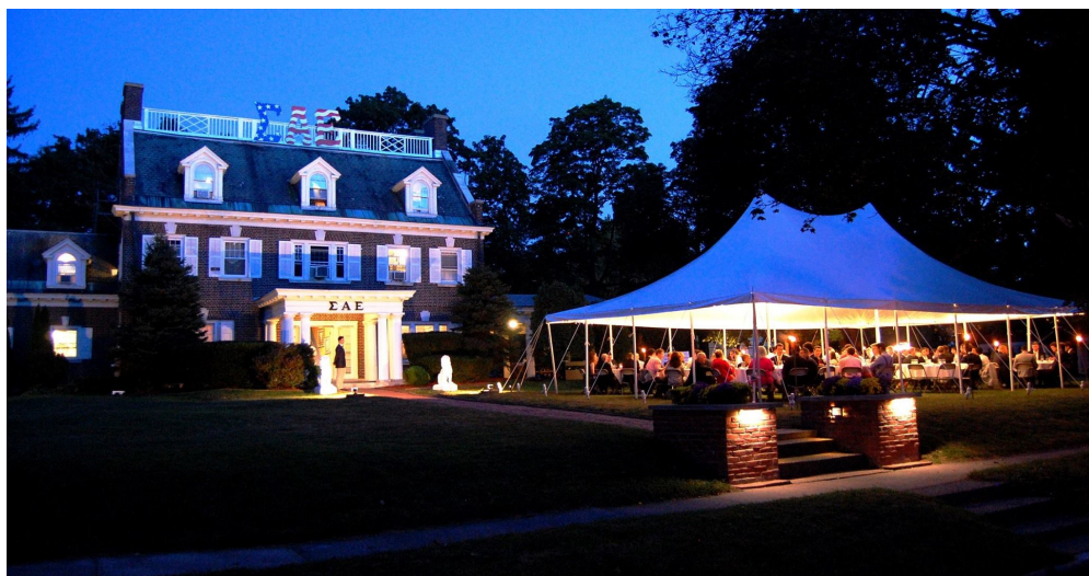
The house of NY Epsilon during its annual Community Enrichment Dinner