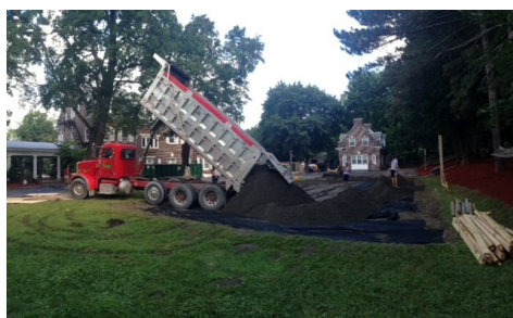
A load of new sand for the volleyball court