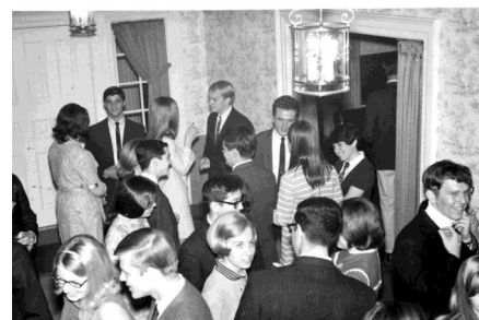
Reception at the "new" house in the early 1960's

Join the SAE RPI Alumni and Actives Facebook group for more frequent news. Updates will be given about the new Alumni Weekend Registration system. It will be used to show people looking at our website, nyepsilon.com , who have already signed up to come to alumni weekend.