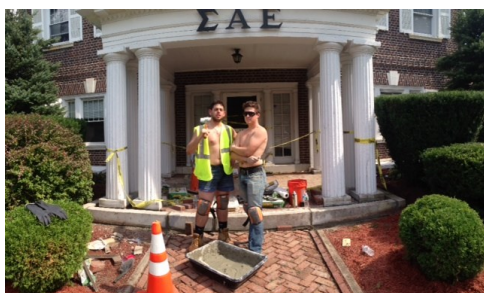
Fixing the front entrance bricks and marble