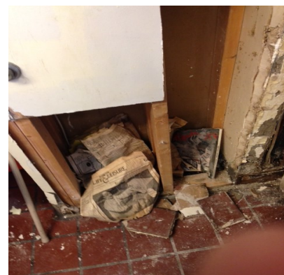
1997 time capsule discovered in the kitchen wall