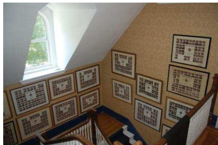
Views of the stairways in 1967 and 2001 with the new wallpaper