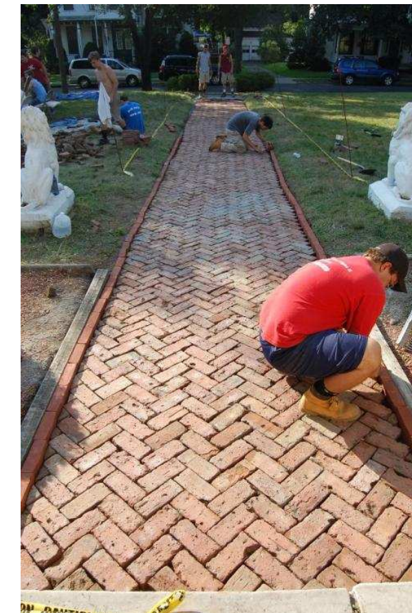
The front walkway at the start and at the end of Work Week 2011 – and yep, there are 1856 bricks in it!