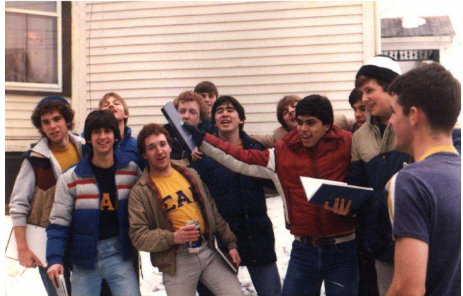
The Class of 1985 as pledges – recognize them? Come back to this fall's alumni weekend to see how they look now.

Please RSVP for Alumni Weekend! We need to know numbers so we can order food for Saturday.