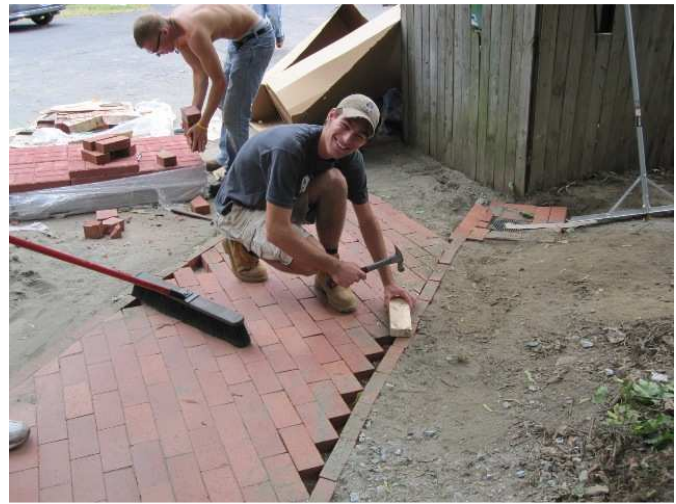
Redoing the sidewalk to complete the restoration of the Garage

This past workweek was focused on improving the look and functionality of the outside. We landscaped the area by the sidewalk that was previously overgrown, installing a 6 foot fence, laying down grass seed and planting bushes along the street side of the fence. The flower bed that wraps around the house received new red mulch which really complemented the color of the brickwork on the main structure. The hill above the volleyball court, which has long been the dumping ground for trimmed brush, was cleared out and a wood chipper rented to dispose of the excess branches. With the garage work completed by the contractor, brothers currently living in those rooms helped paint and install closet organizers, among other things, to finish the project. Overall I was very impressed by the work put in by the brothers this workweek. My plan for the semester is to maintain a very clean house, not only for the duration of rush, but for the entire semester. Having a clean house reflects greatly on who we are as a brotherhood and boosts morale. Special thanks go out to Matt Jeffers '95 and his parents, whose information was indispensible when completing the landscaping around the house.