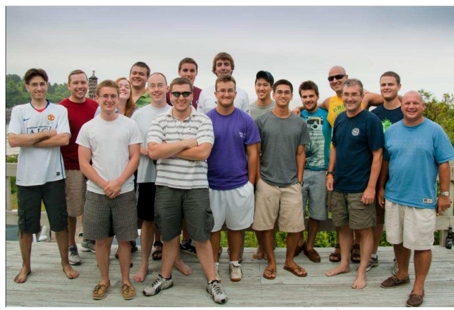
The Undergraduates and Alumni at the LAE/EC Retreat '09

weekends (recently improving). We'll be reaching out to contact many of you to get your input and also to help us find some "lost" or "misplaced" alumni.