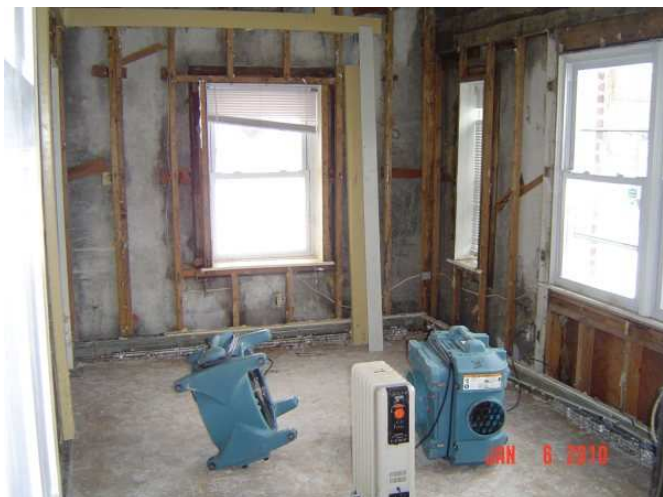
The garage first floor after remediation removed all the damaged wallboard and subflooring.