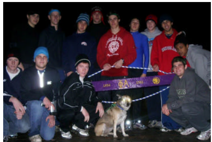
Pledges after their 3 rd successful raid w/ the new Brother Log