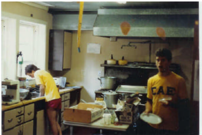
Check out the old kitchen, circa 1988. Who are these guys?