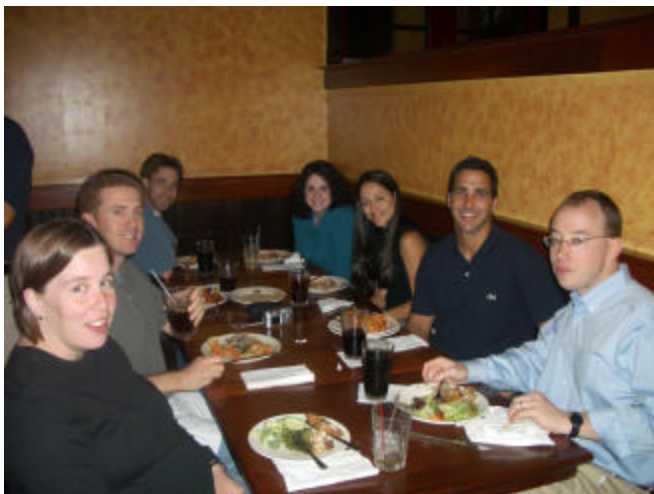
Classes of 1995-96 enjoying dinner at Alumni Weekend